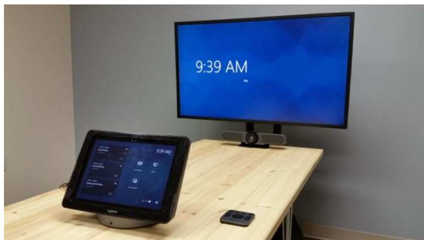
Skype for Business huddle room including Logitech MeetUp connected to Skype Room System (Surface Pro 4 tablet installed in a Logitech SmartDock)

Full Duplex Support – MeetUp passed our full duplex audio test (near and far-end participants speaking and hearing each other at the same time) without issue.